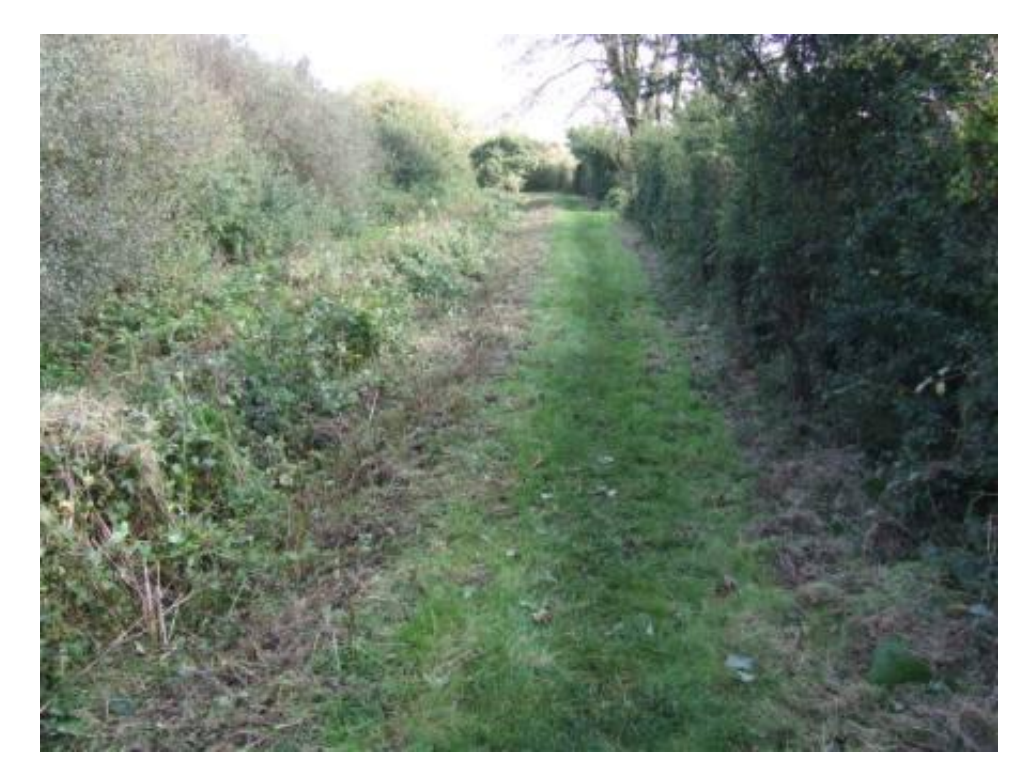
14 Hedge and bank top

Week three and at long last we got back to where we were forced to abandon the fallen tree near the filter bed at Vealand. (Photo 15)