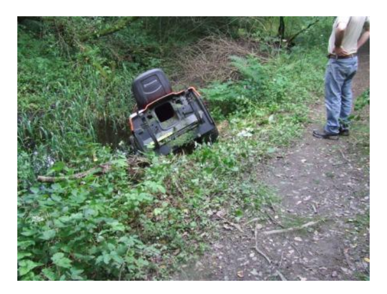
2 An unfortunate mishap

Following a minor mishap the ride on mower ended up nose first into the soft mud of the canal. (Photo 2)