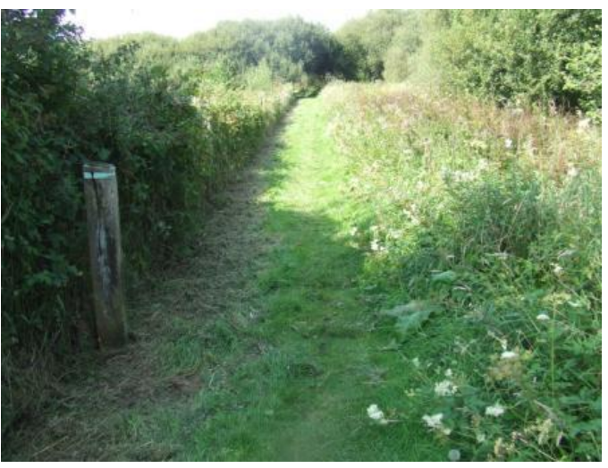
6 Footpath north of Virworthy Wharf

Mowing continued with more broken branches having to be cut back to keep a clear passage. A borrowed extending pole saw was tried out on some lower dead Ash tree branches which proved satisfactory enough to purchase one for the Trust in view of the anticipated work ahead. (Photo 7)