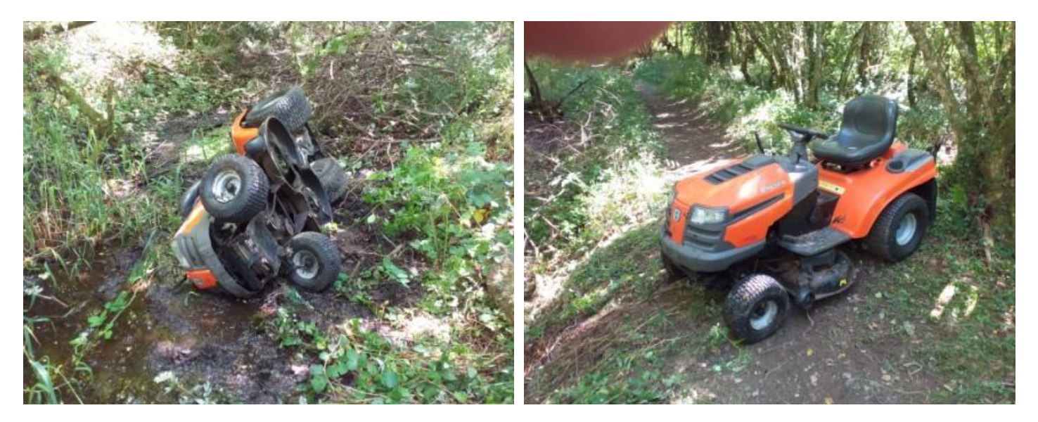
3 Vandalism or attempted theft?