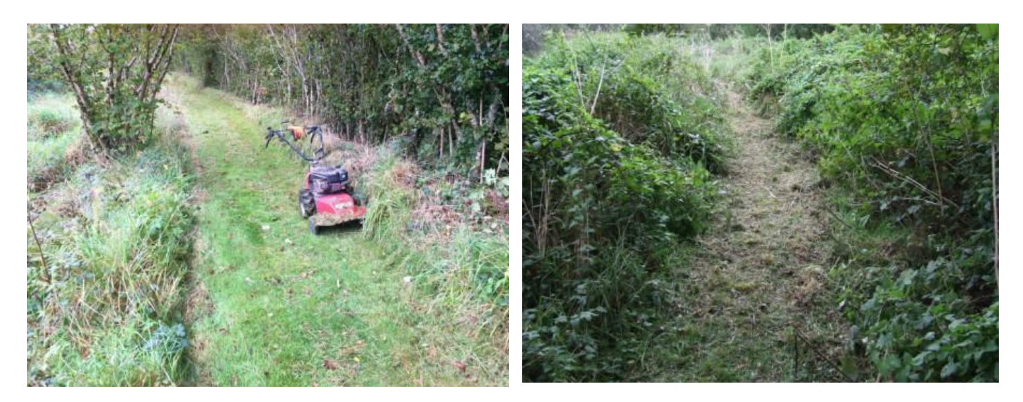
16 Small mower coping well

End of the quarter and back to Vealand Bridge with general vegetation clearance, widening cut with the small walk along mower to the footpath edges and combination of mowers to cut a new path into the filter bed. Twelve months growth made it hard going. (Photos 16 & 17)