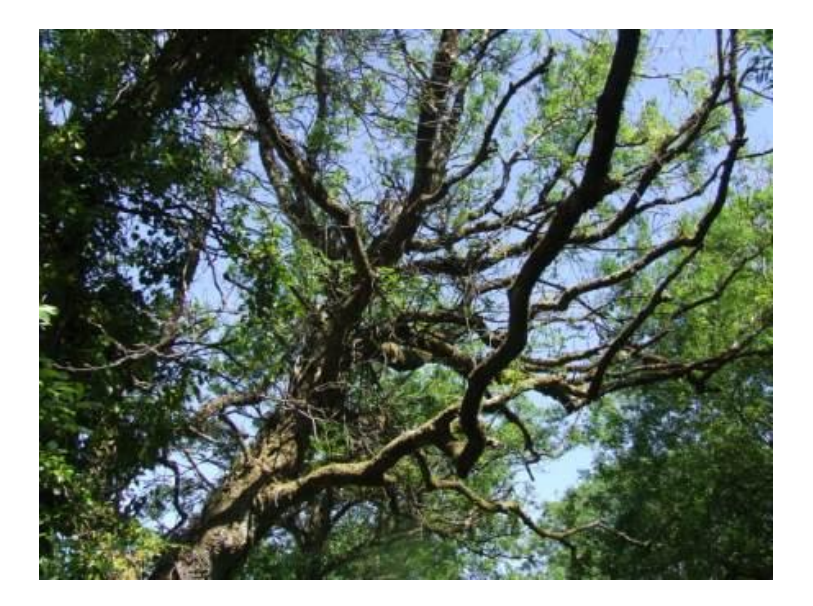
1 A number of dead branches but the rest may recover

With the Ash Die Back survey continuing more trees were discovered, identified and their location recorded and entered onto an action plan for work to be carried out. (photo 1)