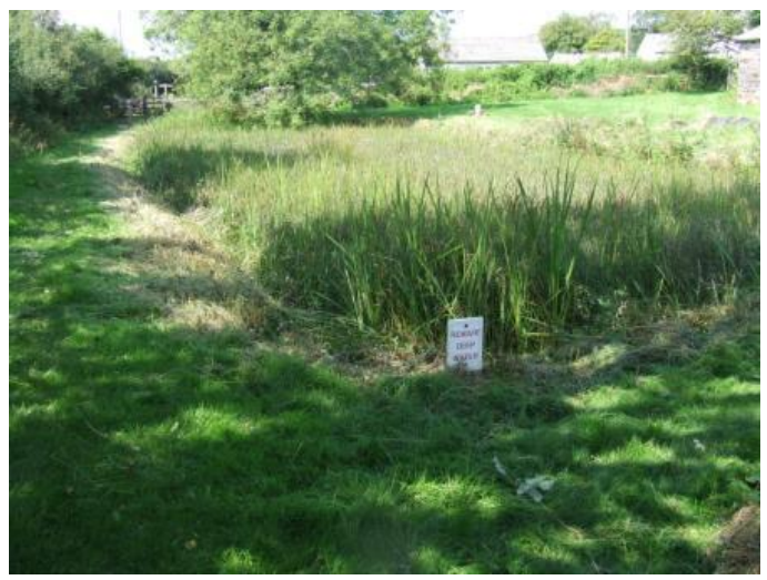
5 Vegetation cleared footpath side of the basin

Our first real day back to do some constructive work with vegetation clearance round the Virworthy Wharf basin and the footpath back to the Lower Lake. (Photos 5 & 6)