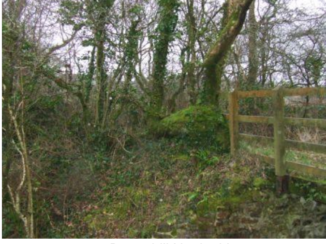
5 Broomhill South side