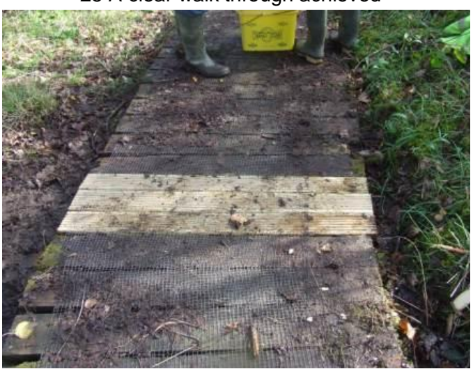
27 Old boardwalk plank repairs

Into the second week of the month with repairs to the planking of the old section of boardwalk beyond the Incline Plane (27) before dealing with a large tree that had collapsed across the canal near the site of the long gone water diversion weir at the far end of Vealand section. (28 & 29) little knowing what was coming before we could return the following week to finish the job.