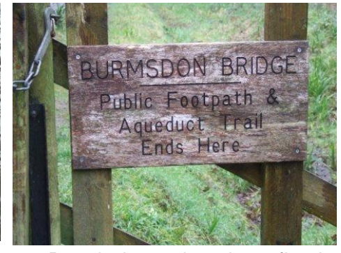
23 Permissive path notice refitted