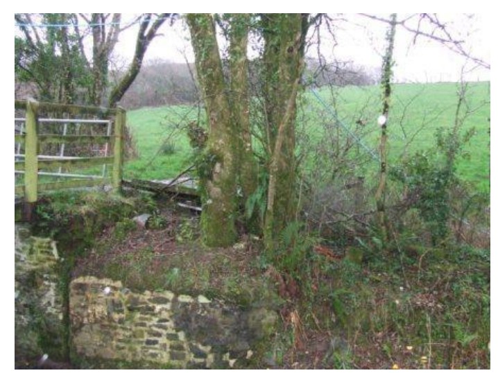
3 Gadlock South side

During the refurbishment of the supporting walls of Gadlock, Wooda and Broomhill Bridges it was discovered that much of the damage being done to the original stonework was caused by the growth of the adjacent trees and their expanding root structure. A survey was carried out in order to obtain a quote for taking out the offending trees and stump treating.(3, 4, 5 & 6)