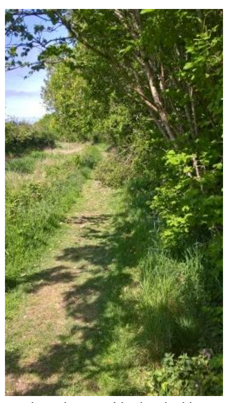
31Branches down at Vealand with another at Virworthy