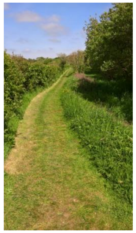
30 Keeping the path clear north of Brendon Bridge