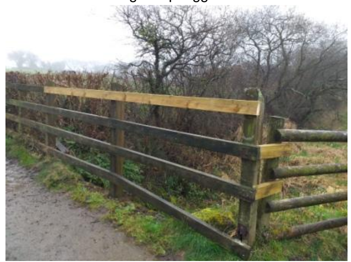
26 Replaced rail and post support at Lana