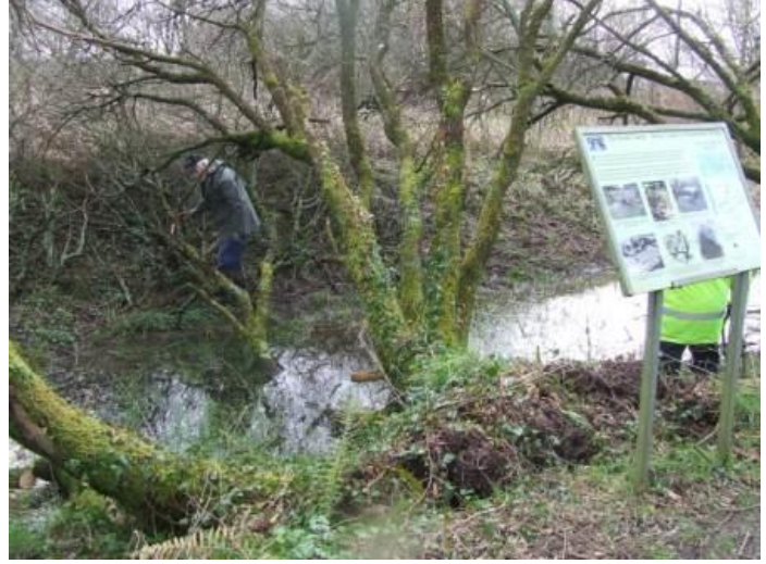
28 Roots ripped out of the ground

Into the second week of the month with repairs to the planking of the old section of boardwalk beyond the Incline Plane (27) before dealing with a large tree that had collapsed across the canal near the site of the long gone water diversion weir at the far end of Vealand section. (28 & 29) little knowing what was coming before we could return the following week to finish the job.