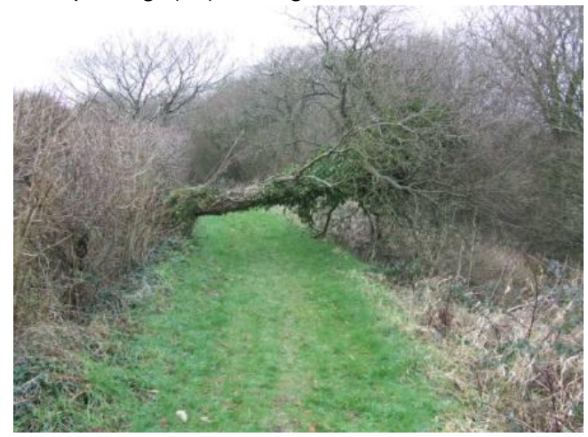
11 Unfortunate loss of a biggish one