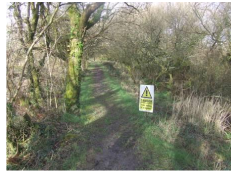
21 Broomhill safety notice

During the refurbishment of the Accommodation Bridge support and 'lead in' walls at Broomhill, Gadlock and Wooda Bridges the expanding root systems from adjacent trees were found to be the main reason for the stones being pushed out of position and steps were taken to remove the trees and stump treat the remains. (s1 Photo 21) & (qi Photo 21) & (g7 Photo 22)The Trust expressed their thanks to the farmers involved in carrying out the operation successfully.