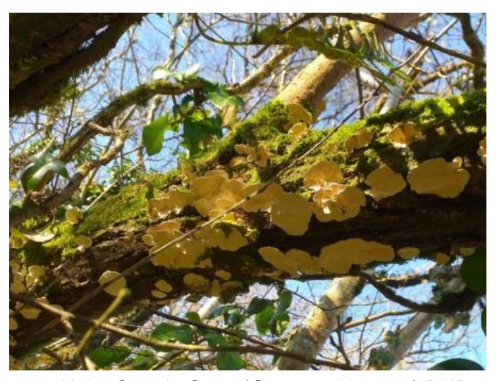
20 Hairy Curtain Crust (Stereum hirsutum) DNR

After several weeks of sorting through the stored paperwork, the first batch of the Aqueduct section historical records were taken to the North Devon Records Office for archiving.