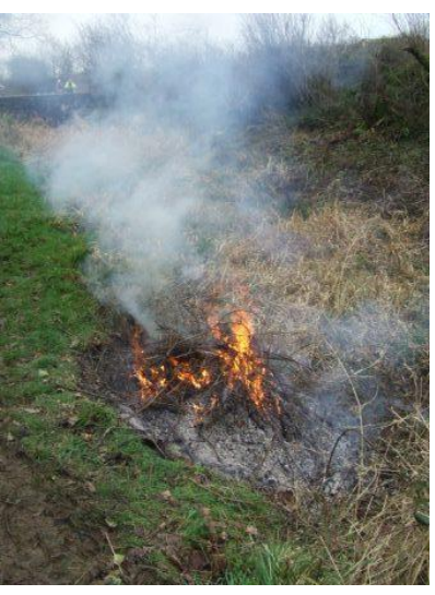
2 Second burn of the day

Unfortunately the following week continued with more wet weather although we did manage to light more fires. Over the next six weeks, time was spent sorting through all the old Aqueduct section records to extract as much historical information as possible for archiving at the North Devon Record Office at Barnstaple.