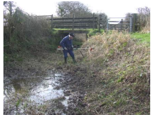
16 Strimming north side of Lana

In the middle of the month Storm Denis swept through the area and as expected, brought down or damaged trees along the path from the Lower Lake to Lana Bridge. (17) North of Virworthy Bridge (18)