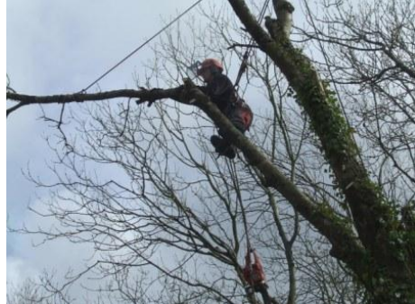
22 Stripped branch dropped