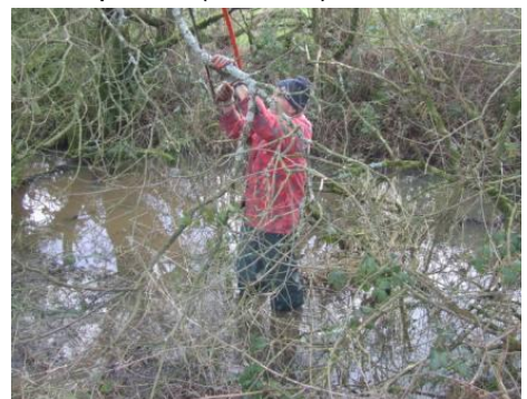
14 Water almost too deep for wellies

Three consecutive weeks were spent north of Lana Bridge removing the invasive willow trees from the canal profile (14 & 15) and strimming round the bridge (16.)