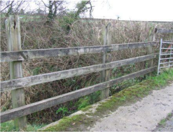
12 New saplings