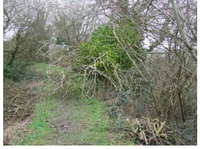
18 Path-blocking branch

and south of Dexbeer Bridge, several smaller branches and damaged trees were left to deal with later, including one (19) North of DNR. A nice example of a rotting wood fungi was seen at DNR (20)