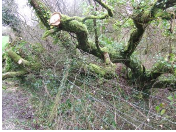
17 Big tree down but under control

In the middle of the month Storm Denis swept through the area and as expected, brought down or damaged trees along the path from the Lower Lake to Lana Bridge. (17) North of Virworthy Bridge (18)