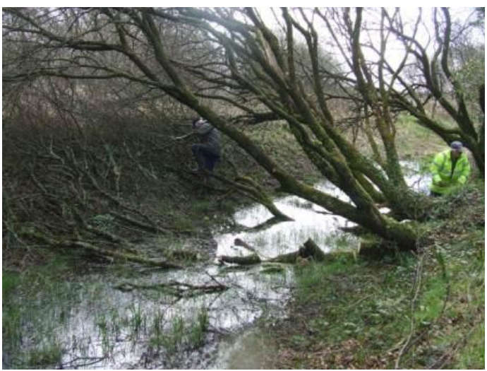
29 Large tree collapsed across the canal

16<sup>th</sup> March, Corona virus stops all work on the canal.