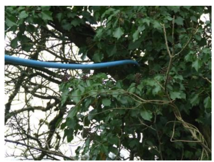
4 Gadlock water feed pipe through tree