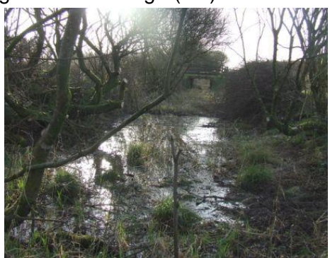
15 and back towards Lana