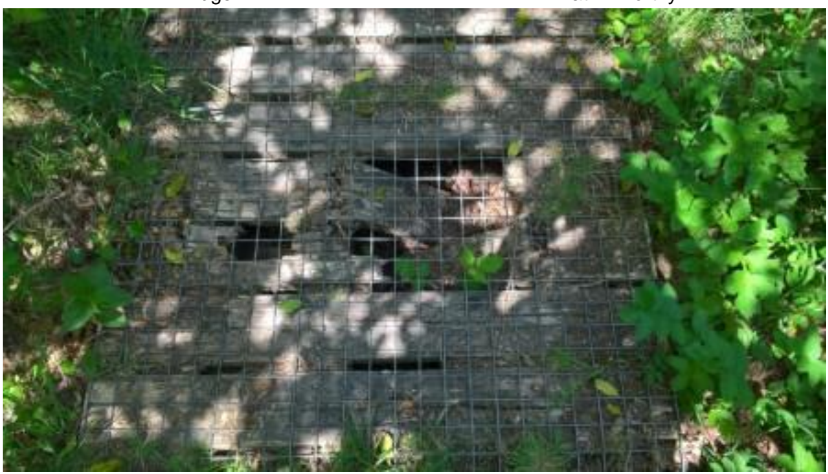
32 Bridge ramp damage at DNR