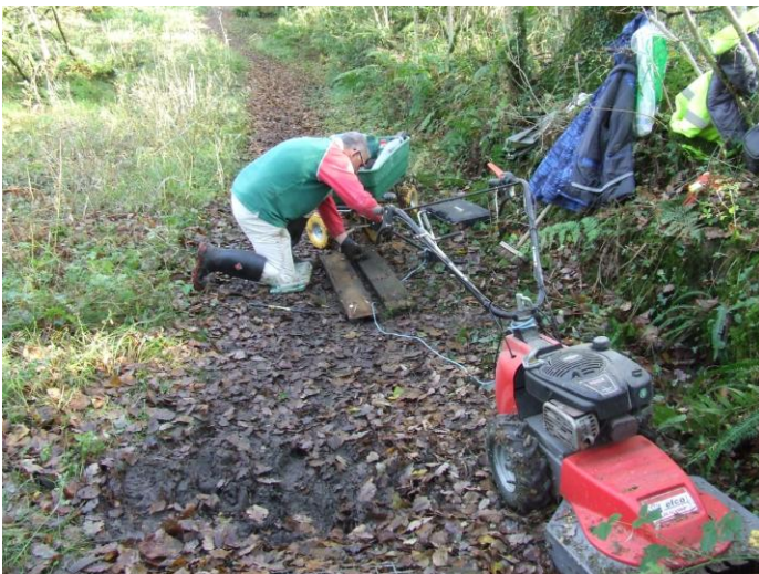
5 Removing nails and staples

A dry day provided an opportunity to finish repairing the old boardwalk boards. (Photos 5, 6, 7, & 8)