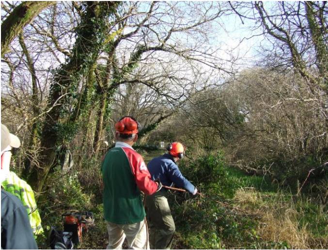
11 Preparing to pull the rope