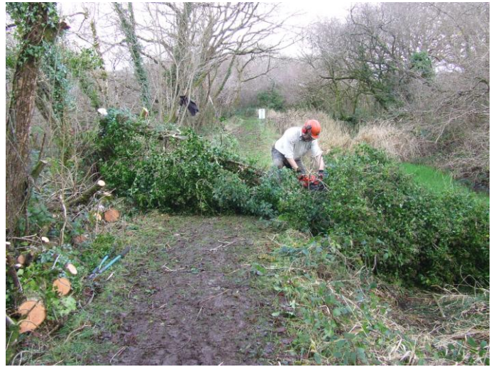
12 Topped tree