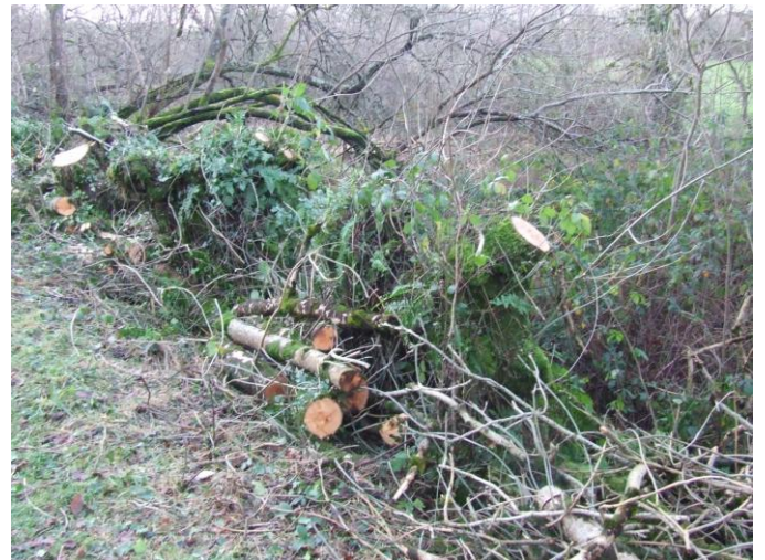
14 Remaining stumps of multi-stemmed root