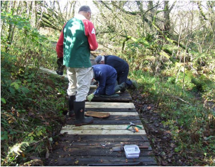
7 Tidying the old wire netting