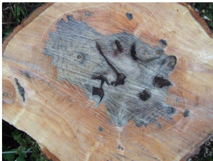
15 Rotting centre of main trunk

Best Wishes to all our readers for a far better New Year and grateful thanks to the Committee, our website manager and the small group of volunteers.