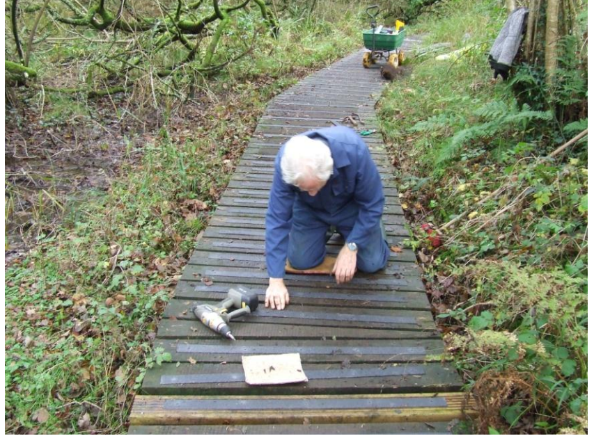
2 Fixing the non-skid pads

A new supply of planks were also supplied by P3 and 12 of the original ones were marked for replacing (Pphoto 3). Frustratingly the following week was also forecast for heavy rain showers which did materialise along with strong winds.