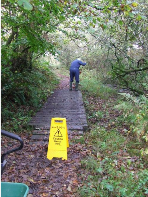
1 Clearing the leaves

Due to the predicted further rise in the Covid virus infection rate and the vulnerability of our volunteers, a further three week break was considered best option. Unfortunately the third work day of Oct was forecast to be extremely wet and the work day was switched to the Thursday, despite only two volunteers being available over 80 non-skid strips were fitted to the original boardwalk planks (now 20-years old). (Photos 1 & 2)