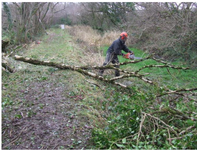
13 Logging up the larger pieces