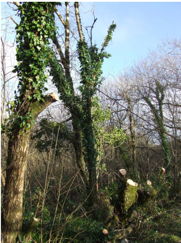
9 Rope in place to ensure direction of fall

This month commenced with the outside rules still applicable. Several trees had dead overhanging branches removed and one heavily infected multi-stemmed ash, all from one main root had to be felled (Photos 9 to 15). With the Covid infection rate rising throughout the country and Christmas just a few days away, this was the last work done on the canal in 2020. What a terrible year.