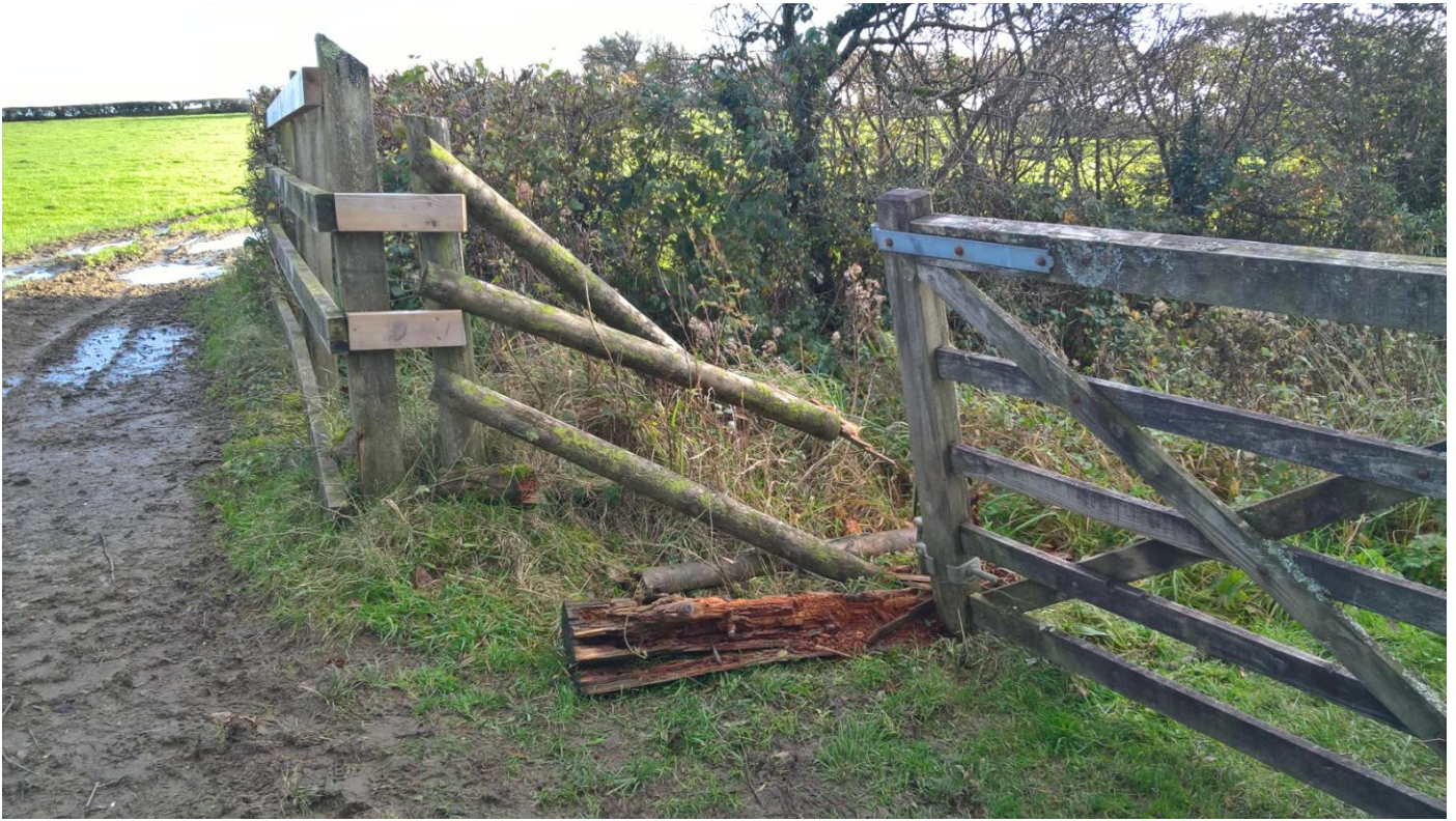
4 Lana Gate collapse

The contractor was met with to discuss the removal of the ADB trees that had been selected as needing severe cutting work and the outstanding replacement gates. This was followed by the collapse of the supporting gate hinge post at Lana Bridge. (Photo 4)