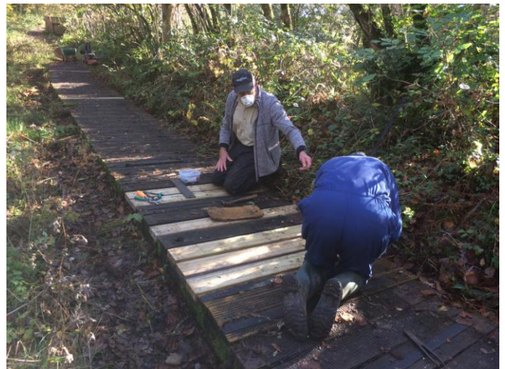
6 Nailing down the new boards