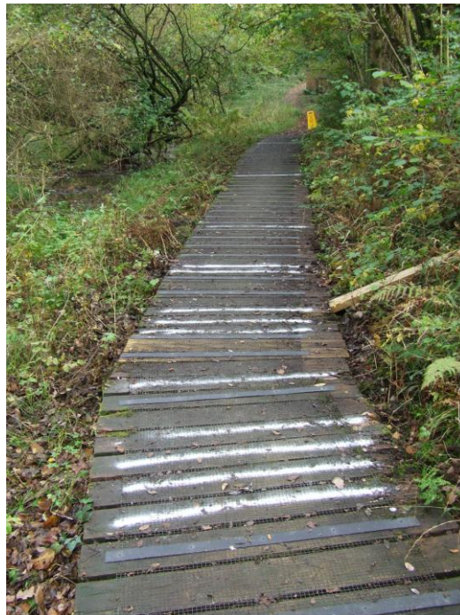
3 Boards marked for replacement

A new supply of planks were also supplied by P3 and 12 of the original ones were marked for replacing (Pphoto 3). Frustratingly the following week was also forecast for heavy rain showers which did materialise along with strong winds.